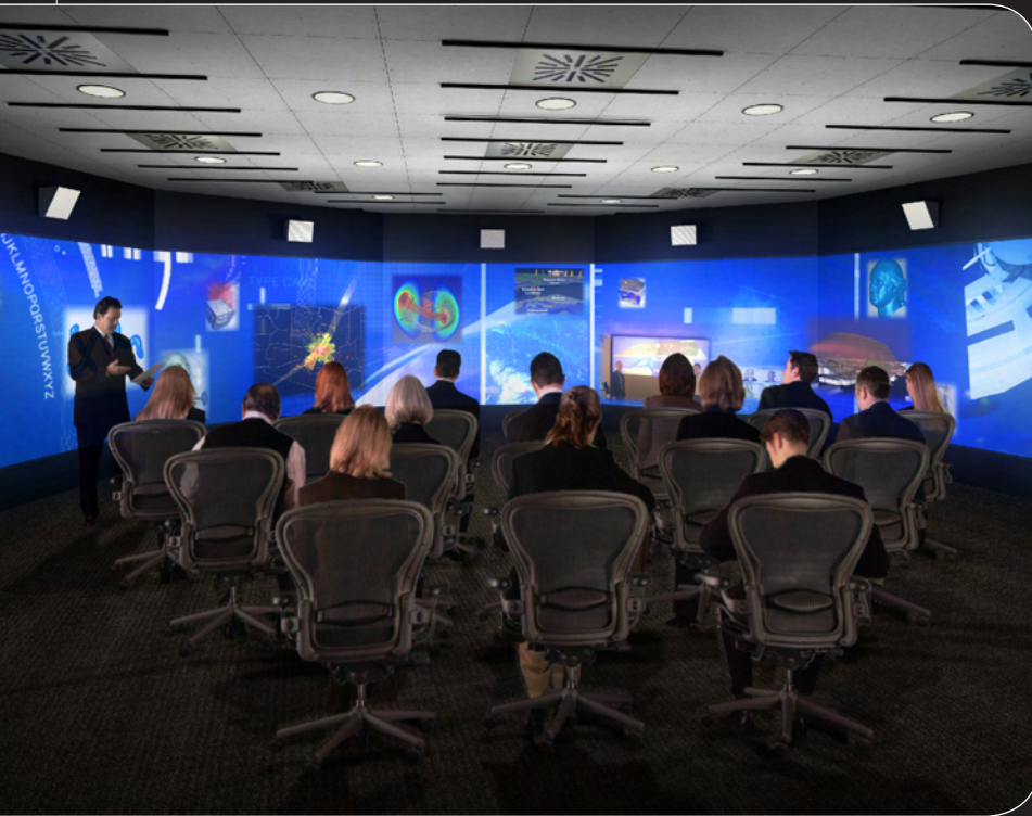
IS-900 VETracker used for interaction in large collaborative decision making environments such as Arizona State University's Decision Theater.

Precision inertial-ultrasonic motion tracking system